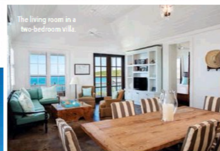
The living room in a two-bedroom villa.

The resort's staff is top-notch – and some have recently undergone intensive training at the Marriott Autograph Playa Largo Resort & Spa in Key Largo, Fla.