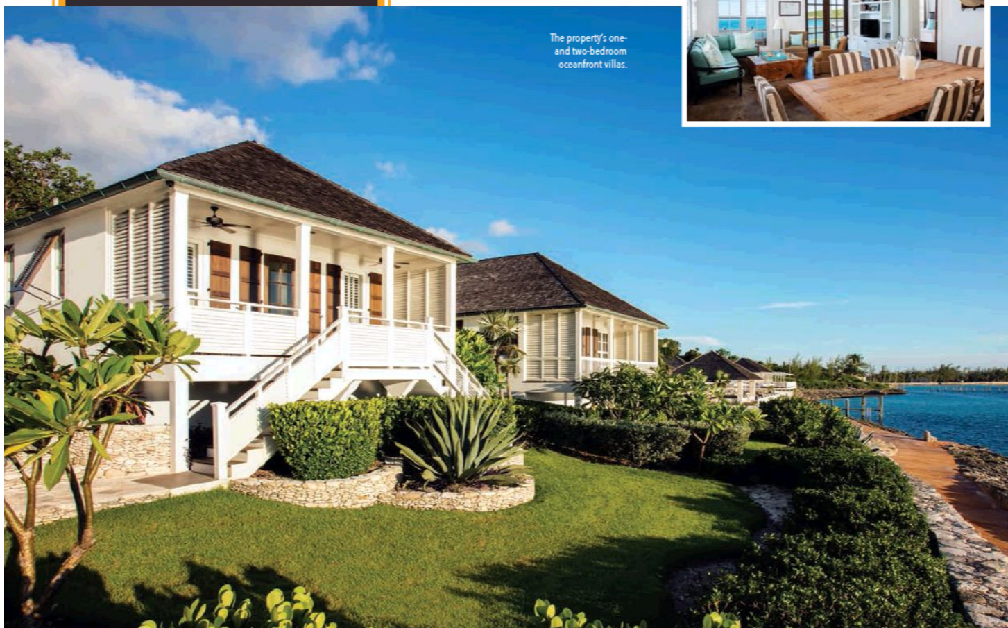
The property's one- and two-bedroom oceanfront villas.